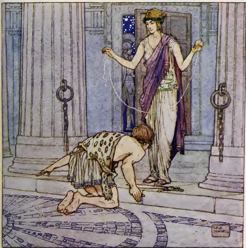
THESEUS & ARIADNE